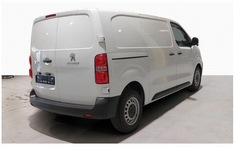
Free Trade-In Valuations