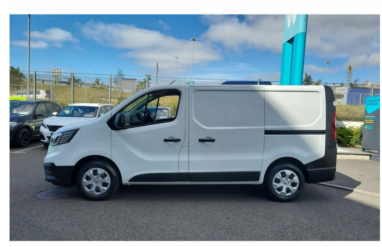
Reserve Quickly Online